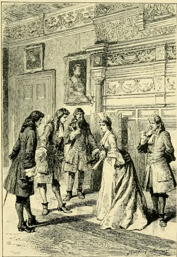
The Marquis introduces his cousin to Lady Ashton.